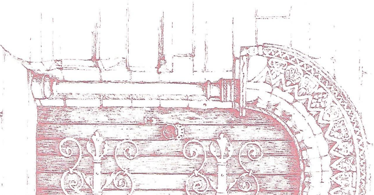
Norman North Doorway, All Saints Church