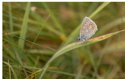
Common Blue Butterfly