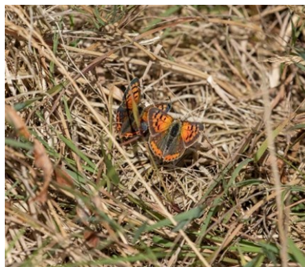
Small Copper Butterfly