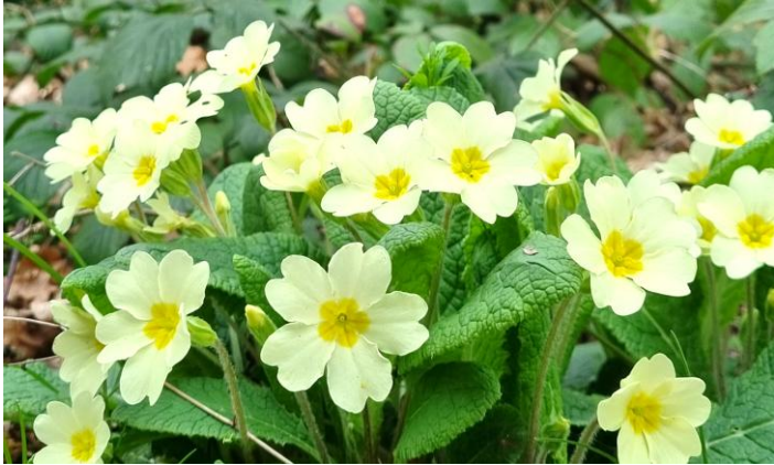
Primrose in Tunman Wood, near Eagle Barnesdale